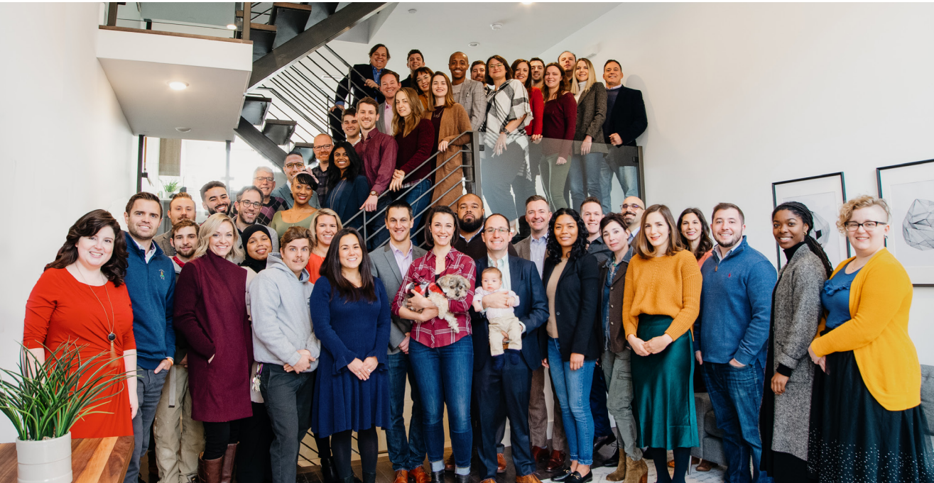
The OCF Realty Team